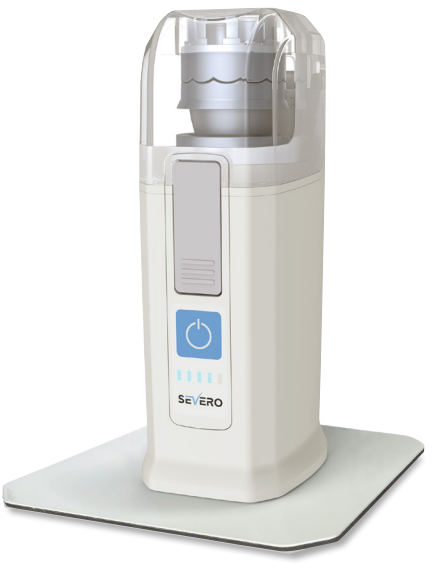
Shown with Stability Plate (sold separately)